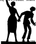
The ultra-feminist may swagger, if she dares and cares, with that stout cane which long ago was made to thwart a thief

In the Canes of Yesterday Are Found Inspirations for To-day, and on Sticks Shorter Than Their Ancient Predecessors, Mount Rare and Old or New and Clever Tops